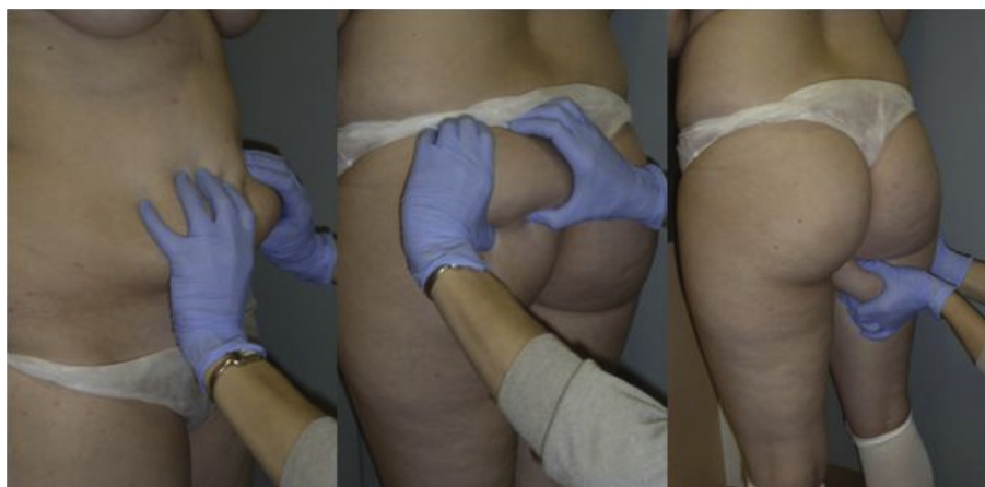
Figure 1 Pinch test.

To our knowledge, our new grading system is an easy, effective and reproducible method to assess the suitability of donor sites for autologous breast reconstruction. It can also improve and standardize communication amongst the surgical team.